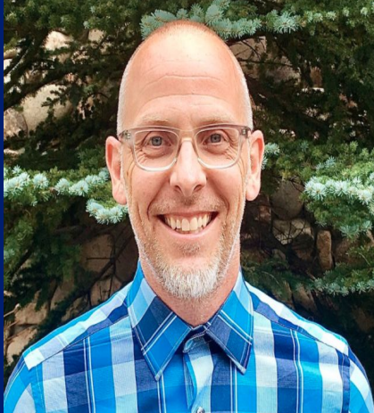
Local Public Health Heath Harmon Eagle