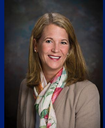
Mayor Barbara Bynum Montrose